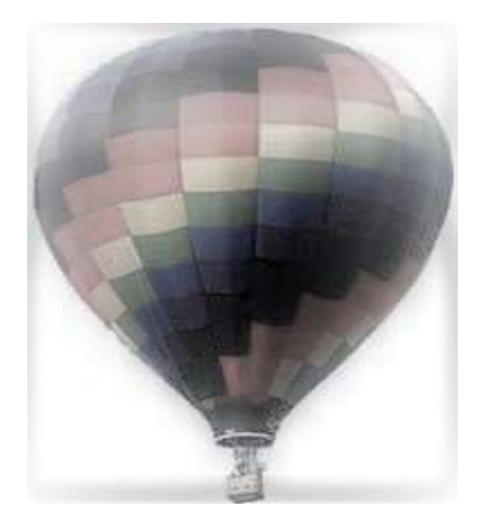
Lifelong Learning in the North Country