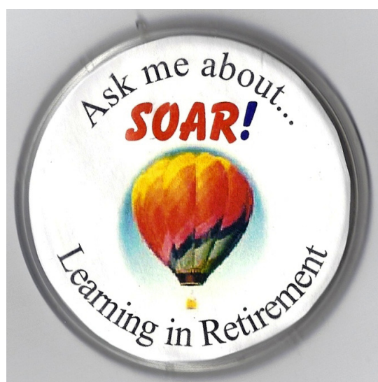
A badge/pin from the early days of SOAR

“I encourage members to volunteer their time and effort to keep SOAR going. Make them aware this is the responsibility of all members, not just administration.” “SOAR is a great outlet for a retired schoolteacher. It is a joy teaching people who truly appreciate your efforts.” “I am happy that we can use Maxcy for walking and swimming.” “I will be forever grateful to the individuals who created SOAR from their dreams, and to SUNY Potsdam for providing us a place to grow.” “I’m proud of being a SOARer.”