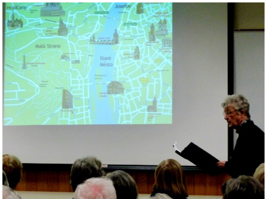
"Vicarious Voyagers X - Prague"