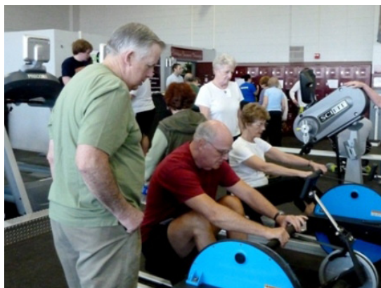
"Fitness for Seniors"