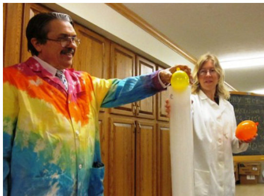
"Dry Ice Demonstration"