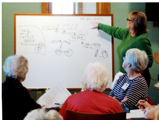
"Numerology for Fun"